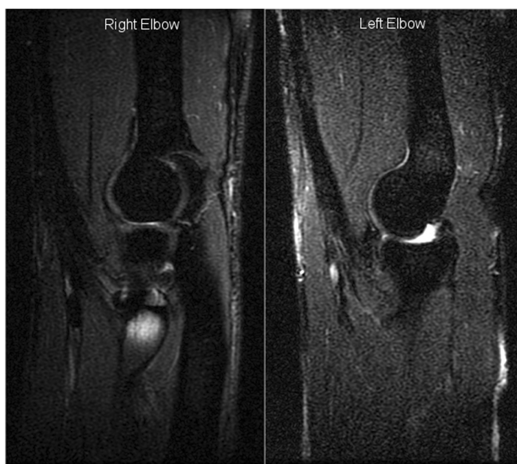
Figure 2 Postoperative MRI at 14 month follow-up demonstrate well proportioned and tight grafts bilaterally. Right elbow is semitendinosus graft and left elbow is quadriceps graft.

Complete ruptures of the distal biceps tendon are classified as acute or chronic, depending on the time period between injury and diagnosis. Ruptures occurring after 4 weeks are generally considered chronic (Bell et al. 2000; Ramsey 1999). However, authors have used a range of time intervals, from 3 to 12 weeks, to define chronic tears (Darlis