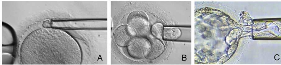
Figure 1 Polar body (A), blastomere (B) and trophectoderm (C) biopsies.

gonadotrophin-releasing hormone agonist and estrogen pill (Progynova, Bayer, New Zealand limited, Auckland). Transfer was carried under ultrasound guidance when endometrium thickness reached 8 mm. Intramuscular administration of progesterone in oil (Prontogest, IBSA, Lodi, Italy) was initiated 5 days before embryo transfer (Hill et al. 2010).