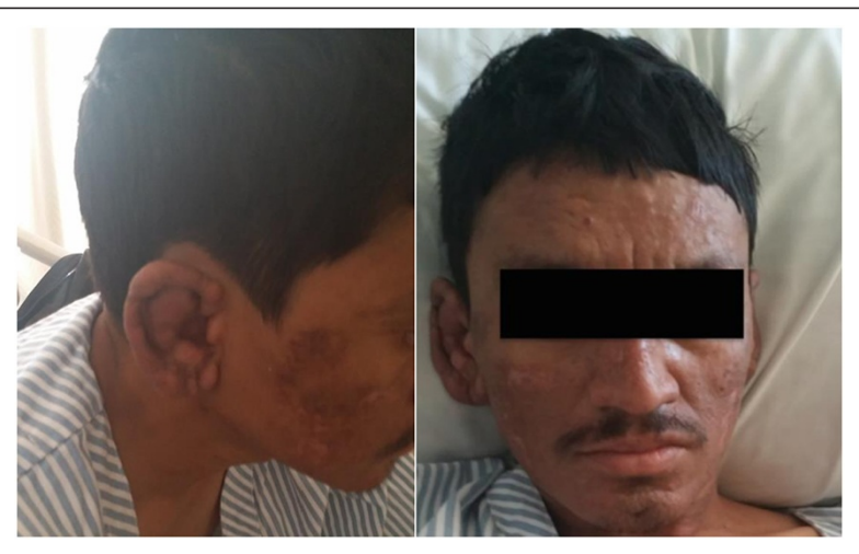
Figure 2 Papulo-nodular skin lesions over the face and ear.

and ESR of 87 mm/1 hr). Urine chemical examination showed 2+ protein and 3+ erythrocytes.