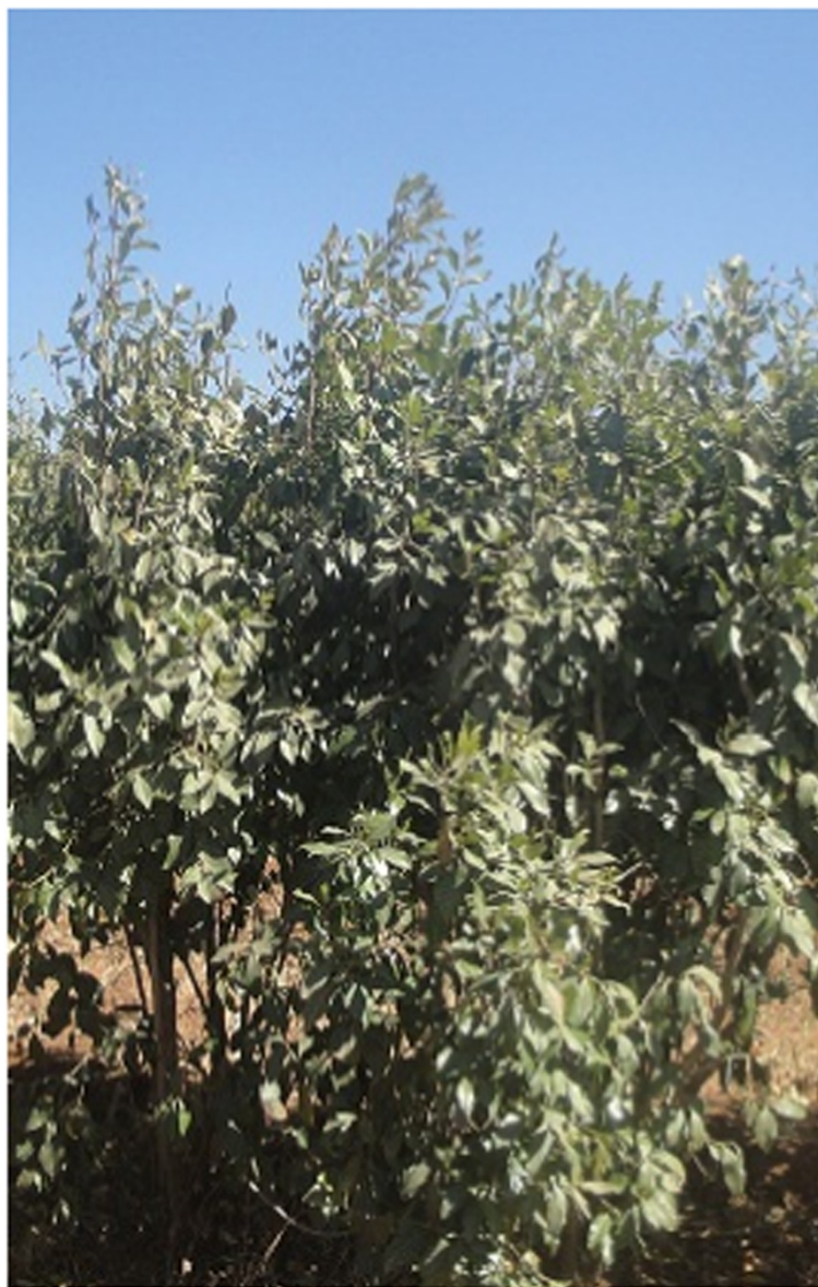
Figure 4 A full mature chat plant.