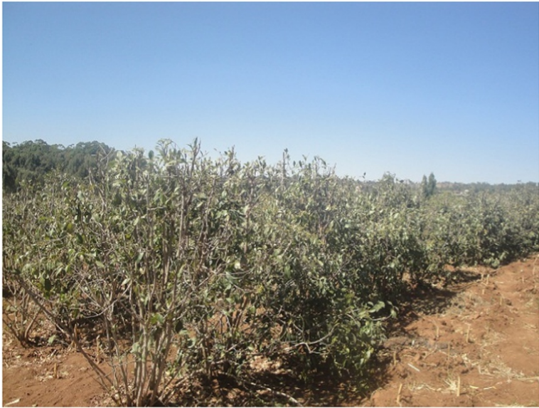
Figure 2 Intercropping of chat with Sorghum.

(legal). In fact, for a variety of reasons, the habit of chat consumption is deeply rooted in social and cultural traditions of Yemen, Ethiopia, Somalia, and Djibouti (Getachew 1996; Bali 1997; Klingele 1998). The present study is an attempt to survey and assess the impact of crop on the community.