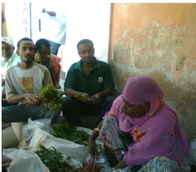
Figure 1 Woman chat seller selling chat to local people.