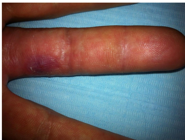
Figure 3 Appearance of the finger after complete healing.

body through an area of broken skin. They typically occur on the hands and feet, but can appear on any part of the body including face, nails and genitals. Warts often disappear spontaneously after a few months but may last for years and can recur (Micali et al. 2004).