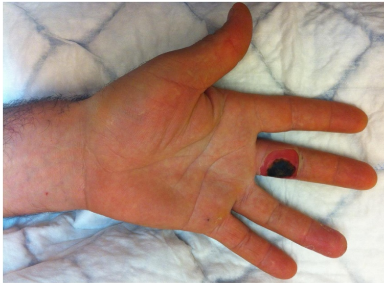
Figure 1 Initial appearance of the finger with skin necrosis corresponding to a third degree chemical burn.

the wound was closed after 58 days of controlled scarring (Figure 3). We decided against skin grafting to improve the aesthetic result and the wound appeared not deep enough to consider a local flap. Complete extension of the PIP joint recovered with use of a 3-point digital splint. Sensibility remained impaired at a 6 month follow-up, with neuropathic pain (tingling, stiffness, numbness) according to the pain questionnaire of Saint-Antoine (French equivalent of the McGill pain questionnaire from Melzack) (Melzack 1975). The assessment of axonal injury was positive: Pressure threshold 1.5 g, 2 point