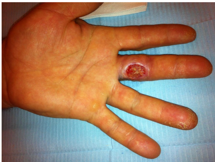
Figure 2 Appearance of the finger after full thickness skin debridement.

Warts are caused by some species of human papillomavirus (HPV) and affect adults and children (Lebwohl et al. 2010). They are contagious and usually enter the