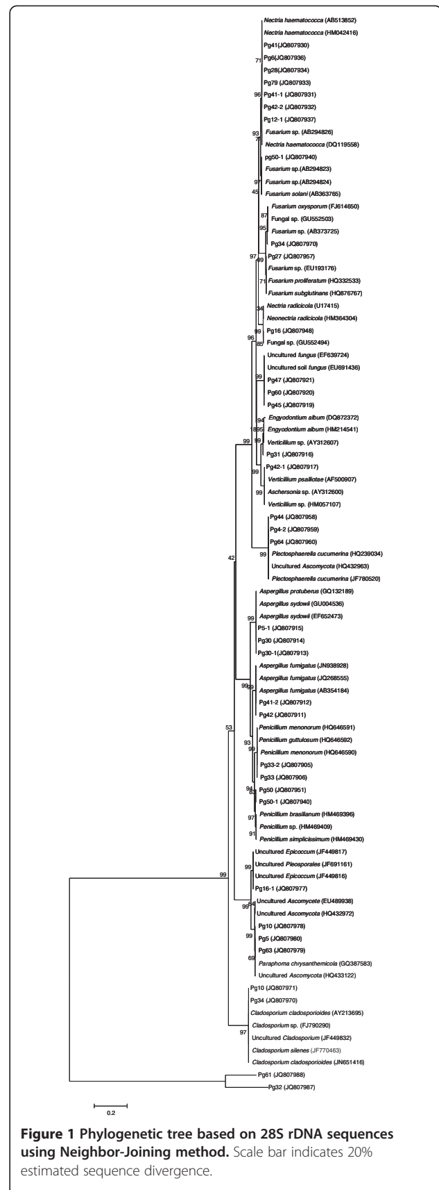
Figure 1 Phylogenetic tree based on 28S rDNA sequences using Neighbor-Joining method. Scale bar indicates 20% estimated sequence divergence.

Thirty-eight endophytic fungi were isolated, and they were classified into nine genera according to the morphological types and 28S rDNA sequencing results. Three isolates (Pg45, Pg47, and Pg60) were not identified because of lack of comparative sequences: their sequences were