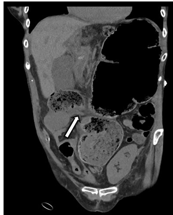
Fig. 1 Abdominal/pelvis CT demonstrating significant dilatation of the cecum and proximal allograft ureter (arrow)

This patient's AKI was multifactorial and encompassed prerenal, renal, and postrenal causes. The prerenal contribution resulted from poor oral fluid intake, which responded to rehydration with normal saline. Renal components included acute tubular necrosis (ATN) and drug-associated injury from supratherapeutic tacrolimus levels (in part due to gastrointestinal disturbances and perhaps due to drug–drug interactions with fluconazole) leading to vasoconstriction and tubular toxicity.