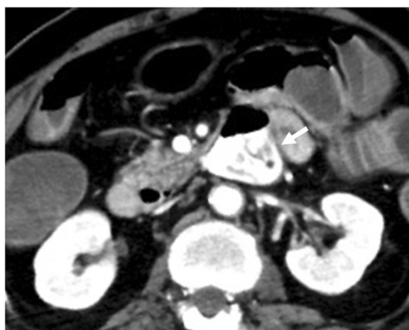
Figure 1 CT angiography via the venous approach depicts extravasation (arrow) of contrast medium in a large diverticulum in the ascending duodenum.

Angiography of the IPDA and plain CT immediately after the procedure depicted occlusion of the responsible artery at the duodenal wall and accumulation of NBCA-Lp in the diverticulum, respectively (Figure 3b). The patient's blood pressure rose to 130 mmHg and was maintained at