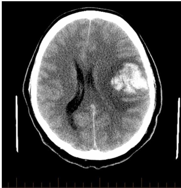
Figure 1 Non-contrast axial CT scan showing large frontal hemorrhage with peri-lesional edema and evidence of mass effect.

patient was hyperventilated and given a 200 mL bolus of 20% mannitol (0.58 g/kg). A repeat CT scan to rule out further hemorrhage showed no change from the previous in terms of hemorrhage, swelling or brain stem compression. A neurologic exam performed immediately after the CT scan, 30 minutes after the mannitol bolus, the patient had deteriorated with absent pupillary response, absent corneal reflexes and a total lack of eye movement on oculocephalic reflex testing, no spontaneous breathing and extensor posturing in the extremities to painful stimuli. It was felt that the patient was not salvageable. Before calling in the family and withdrawing active care, a transcranial Doppler (TCD) was performed in the emergency department to assess cerebral flow. The TCD was performed by the first author (a neurosurgeon and a neuro-intensivist), using a P4-1c Phased Array probe (ZONARE Medical Systems, Inc., Mountain View, CA, USA), operated at 2–3 MHz to insonate the temporal windows bilaterally. There was reverberating flow in the left middle cerebral artery (MCA) compatible with cerebral circulatory arrest on that side, but a high resistance pattern of flow in the right MCA (Bellner et al. 2004). Optic nerve ultrasonography was also performed and showed bilateral dilatation of the optic