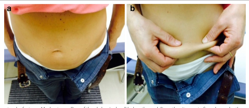
Fig. 1 Lipohypertrophy features. Moderate swelling of the abdominal wall below the umbilicus, the site most often chosen by the patient for insulin injections; his right hand pinches a thick fold in the presence of a large lipohypertrophy skin plate (a); while only a thin fold results from the left hand squeezing the area systematically ignored for insulin shots (b)

The continuous variables were reported as mean value \pm Standard Deviation. Between-group comparisons made use of the Mann–Whitney test. Categorical variables were summarized in terms of frequency and percentage and the Fisher test was used to evaluate associations