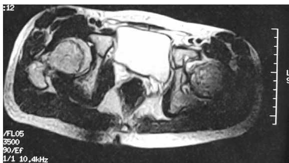
Fig. 3 The horizontal MRI of bilateral hip joints, the femoral head and acetabular articular surfaces were rough