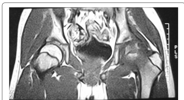
Fig. 4 The coronal MRI of bilateral hip joints, the left acetabulum became shallow, the femoral head was shifted upward slightly

other changes such as oozing, bleeding and synovial thickening are recoverable (Brummel-Ziedins et al. 2009).