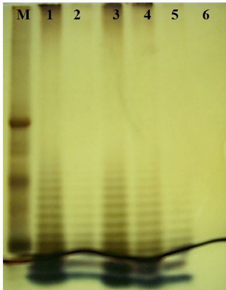
Fig. 2 SDS-PAGE for LPS and OSP detection Lane M Molecular Weight marker, Lane 1–5 contains different amounts of S. Paratyphi A LPS in 5, 1, 5, 2.5 and 1 \mu\text{g} respectively shown in ladder like pattern, Lane 6 contains 10 \mu\text{g} of S. Paratyphi A OSP not visible by silver staining

years old as well as older children (Ouchterlony et al. 1986). Several groups including the International Vaccine Institute (Seoul, Republic of Korea) are developing bivalent enteric fever vaccines which combine Vi conjugate ( S. Typhi component) with O-specific polysaccharide conjugate (OSP) of S. Paratyphi A .